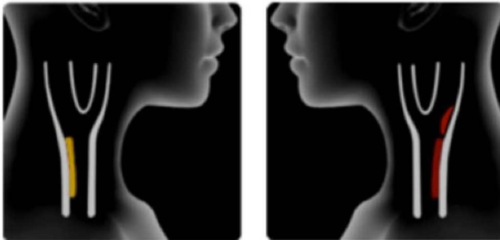
Figure 2. Example of stylised ultrasound images shown to participants in the ViPViZA intervention group.

other formats to communicate risk? A person-centered approach?”